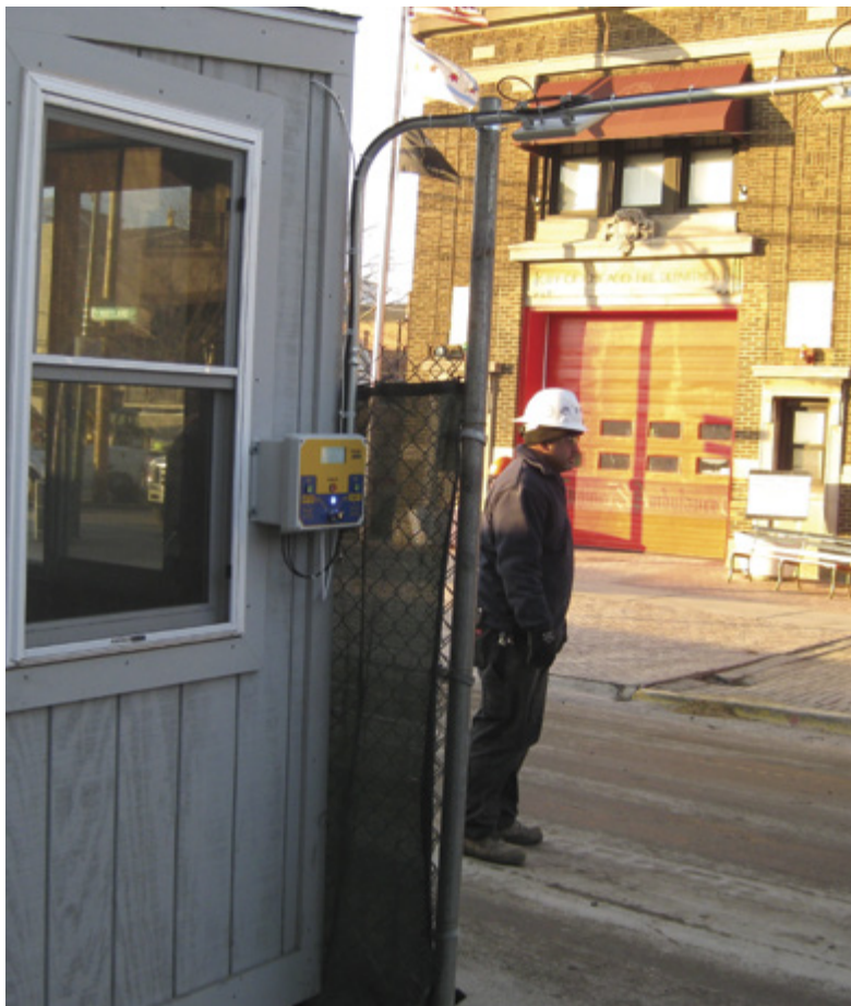
CrewSight lets you set up controlled access points and monitor open access areas on the job site.

With a direct connection to Trimble Prolog, your Daily Work Journals are automatically updated to maintain tight alignment between field and office.